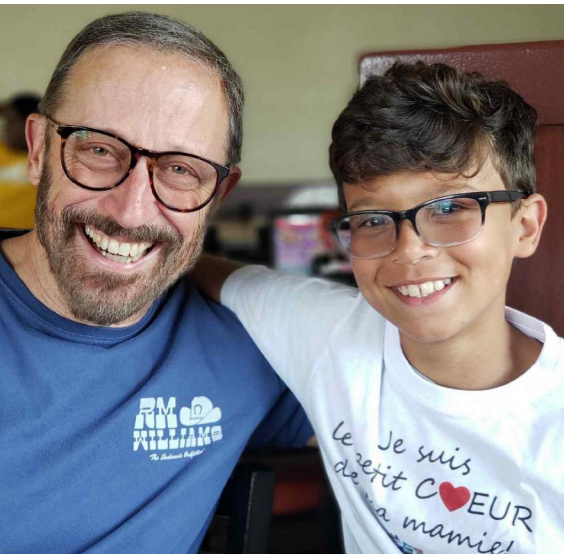
Mentoring with Kids Hope makes a difference!